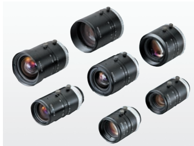
SV-H Series for 2/3-inch image sensor