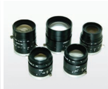
VS-H1 Series for 1-inch image sensor