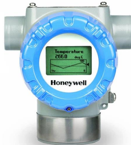
Figure 1– Smartline STT850 Temperature transmitter