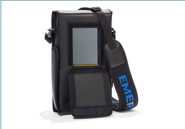
The useful carrying case protects your Trex unit in the field and provides storage options for accessory items.