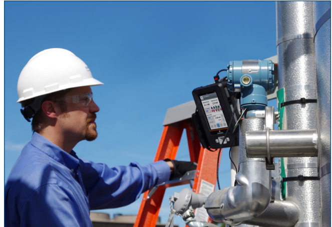
The magnetic hanger accessory allows you to attach the Trex unit to a pipe, freeing up your hands for other work.

AMS Inspection Rounds on AMS Trex digitizes information collected during inspection routes to drive operations and maintenance action. By delivering information to automation systems, personnel have accurate, real-time information that enables them to make better decisions. Graphical dashboards deliver insight into plant condition, helping prioritize action and highlighting critical safety issues.